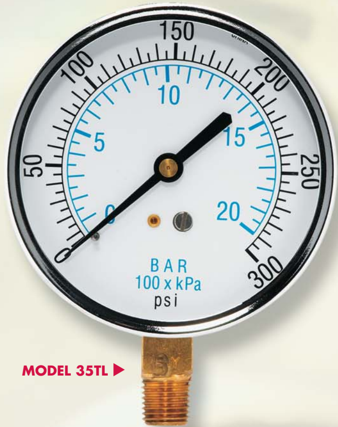
MODEL 35TL ▶